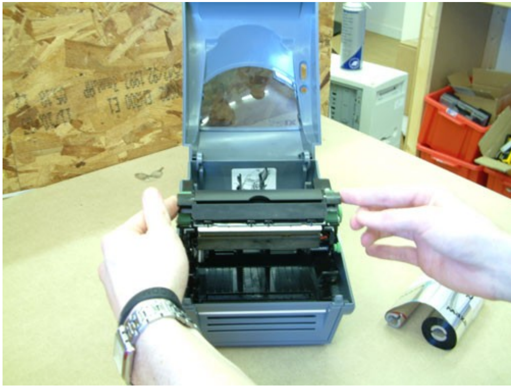
Lift and push the ribbon housing back as far as it will go