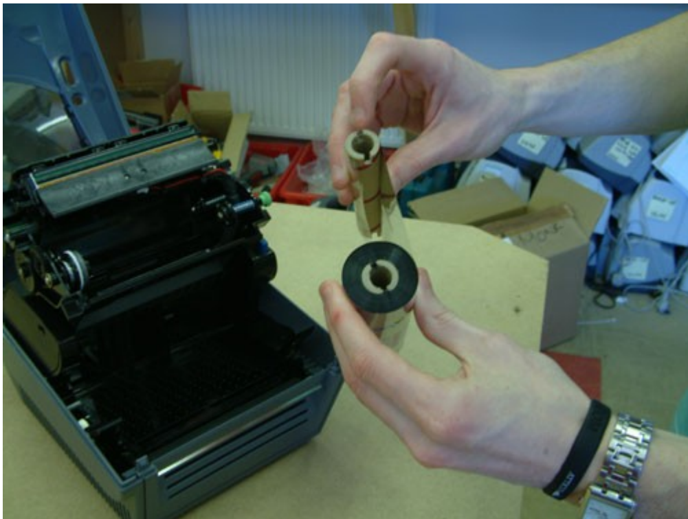
Note the grooves in the cardboard tubing. These must slot into the roller lugs tightly.